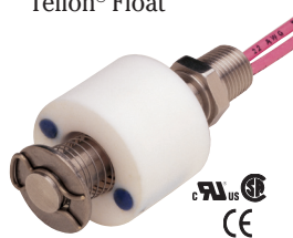
LS-1700 Series – Teflon® Float