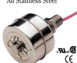
LS-1750 Series – All Stainless Steel