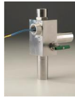
Custom EFV Series