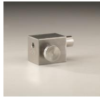
EFV MRS Series