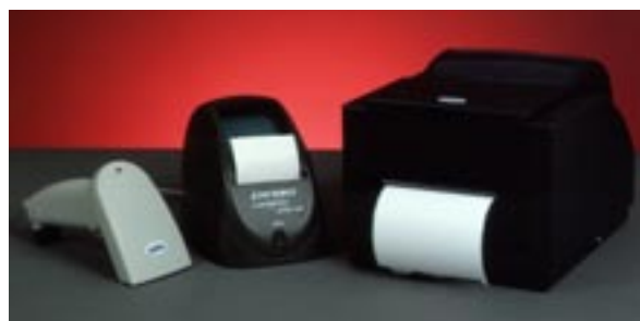
Super Peripherals: (From Left) 500 Scanner, 300 Dymo Printer & 400 Direct Thermal Printer

Label Design Software & Cable Kit simplifies the programming of the RS-232 output through a PC program which converts text and data fields into ASCII codes that can be downloaded into the scale through the RS-232 port.