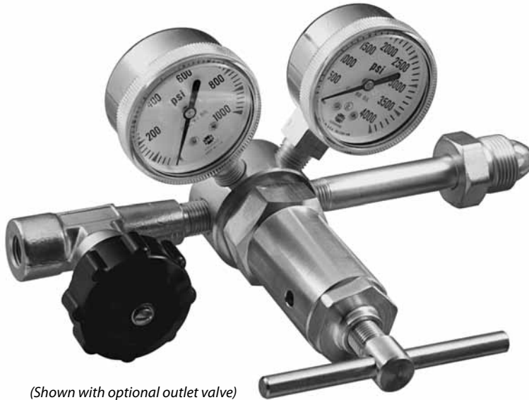
(Shown with optional outlet valve)

High Pressure Economy Brass Cylinder Regulator