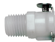
Typical shown: 1/4" NPT Male Pipe Thread with Shut-off Valve

These adapters are available with or without an integral shut-off valve. The shut-off valve will stop line flow when the adapter is removed from the unit. Flow resumes when connected.